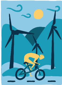
EARTH WIND & TYRE A RENEWABLE WORLD CHALLENGE

Taking part in a challenge event for Renewable World is a great way to build team spirit and create a real sense of pride and achievement. We are expert in developing inclusive challenges that work well for global teams.